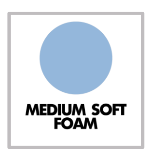
AS AN ALTERNATIVE TO WOOL